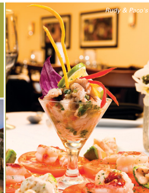
Rudy & Paco's

12 Explore Pier 19 where Galveston Island chefs come to pick the best fresh seafood the Gulf has to offer!