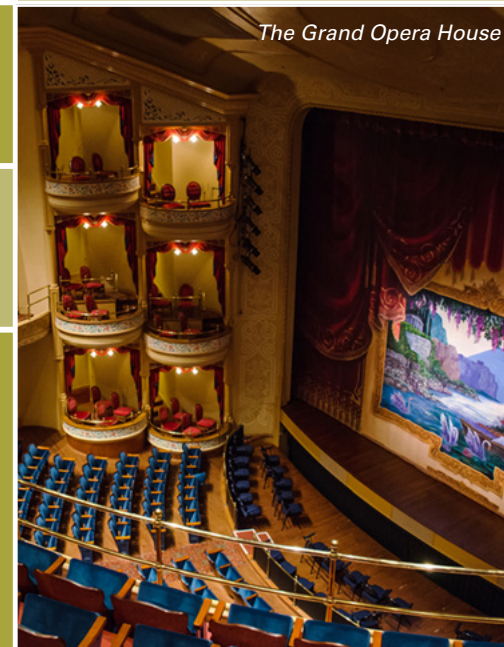
The Grand Opera House