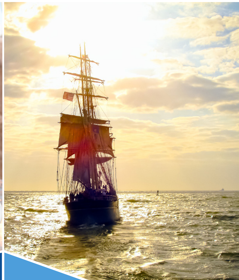
1877 Tall Ship Elissa