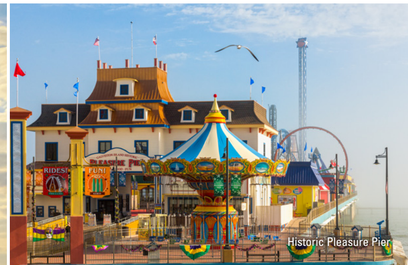
Historic Pleasure Pier