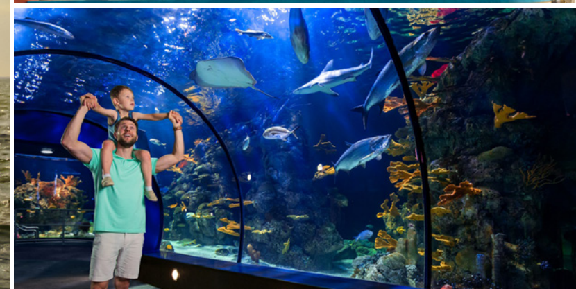
Aquarium Pyramid at Moody Gardens